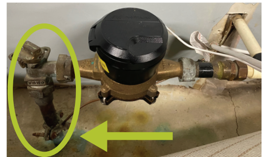
Service line here (copper) indicated by the arrow.

before 1952, to identify their type of service line. Service lines are owned by the property owner. Thank you in advance for your help!